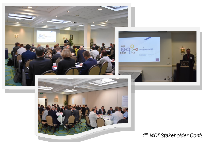
1 st i4Df Stakeholder Conference

For following Stakeholder Conferences and Expert Workshops a wider group of stakeholders will be invited, including Industrial Lead Suppliers and Research Providers.